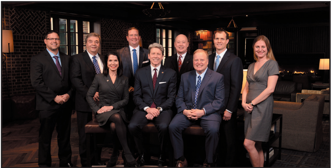
The 2019 Board of Directors